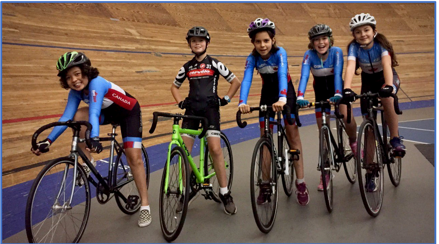
iRide Summer Camps in Burnaby, Prince George & Nelson attracted over 265 riders, 80 of whom visited the Burnaby Velodrome and Ridge Meadows BMX track