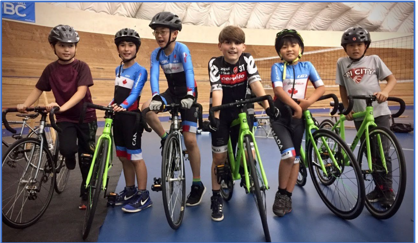
iRide introduced 425 students to the Burnaby Velodrome during ½ day field trips